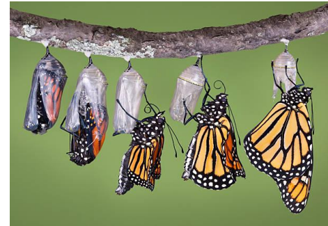
Moment of growth